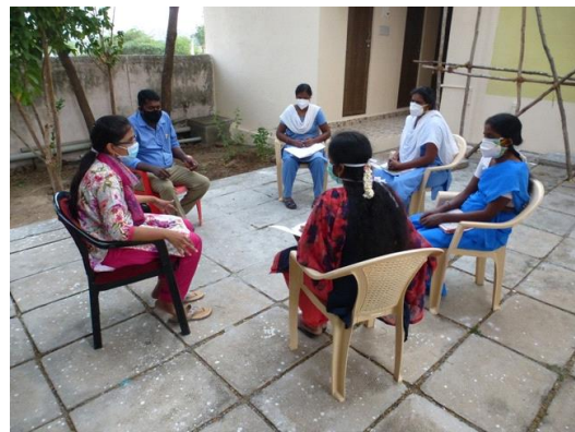
CLASS & TRAINING FOR NURSES

For snake bite cases patients are given first aid and then referred to government hospitals. Some people met with minor accident come to MHC for sewtcher and bandage of their wounds. Children with first degree burns are also given treatment. Patients with diabetics and with diabetic wounds are coming to MHC for treatment and for medical consultation.