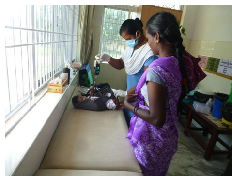
GENERAL TREATMENT & EMERGENCY CASES:

In case of any pregnant women who are unable to deliver in a normal process or, if the heartbeat of the baby in the womb is not even or, if the baby position is not in normal way or, if the pregnant women needs to be done an caesarean section or any other complications during delivery or if the delivered patient needs special sewtcher(perennial tear) the MHC staffs refer the patient immediately with due care at once to the nearby Government Hospital or to private multi-speciality hospitals for further medical attention by MHC ambulance. Home visits are also done to these patients after their discharge from the government hospital.